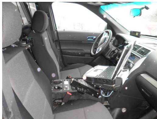
Patrol Car- Passenger's side