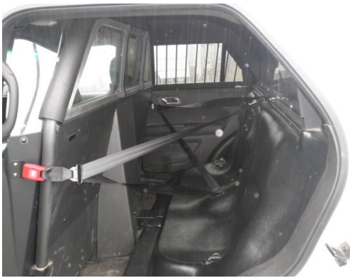
Back Seat of Patrol Vehicle