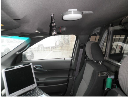
Spotlight handle (can use right hand only)