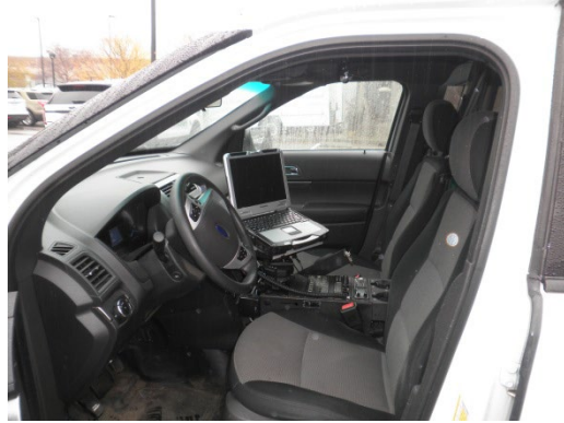
Patrol Vehicle- Driver's Side