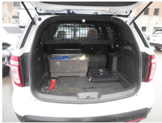
Back Storage of Patrol Vehicle