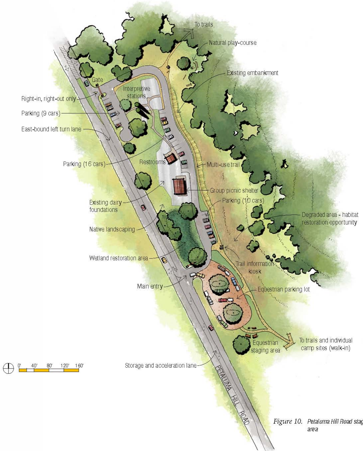
Figure 10. Petaluma Hill Road staging area